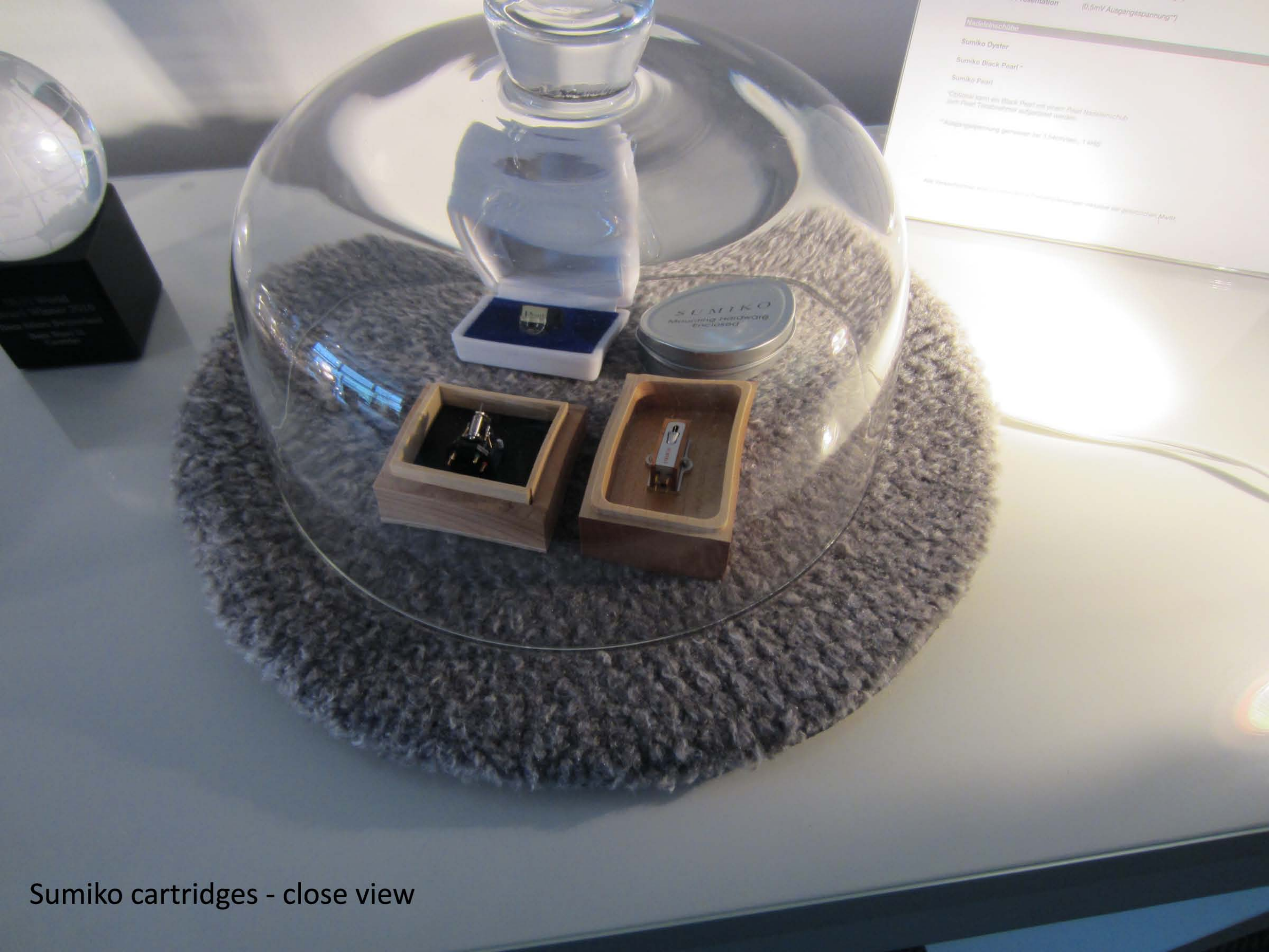
Sumiko cartridges - close view